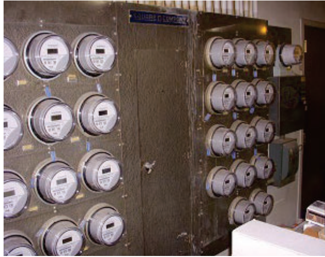
Figure 3 — Ganged Meter Socket